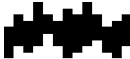
Planche n° 31